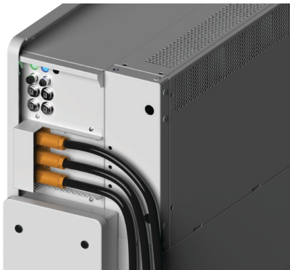
AC quick connectors.